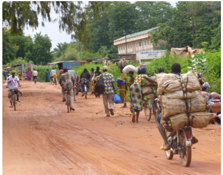
Figure 2. A man transports eggplant by motorcycle to a vegetable market in Banfora, Burkina Faso. In the foreground, a woman transports cabbage by bike.

cans. In contrast, our survey of dry season riparian agriculture, conducted in July 2012, found that farmers now cultivate over 600 hectares, distributed in individual plots ranging from 0.1 to 5 hectares in size. Almost all of these plots are irrigated with diesel powered water pumps. Dry season farmers primarily grow vegetable crops, including cabbage, eggplant, onions, hot pepper, tomatoes, and okra, which are destined for consumption throughout Burkina Faso and neighboring Cote d'Ivoire. Every morning dozens of bicycles and motorbikes make