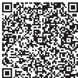
FIGURE 2 Ten Steps for Writing an Exceptional Personal Statement: Digital Tool

Note: Use the QR code to download the digital tool and follow the 10 steps highlighted in FIGURE 1.