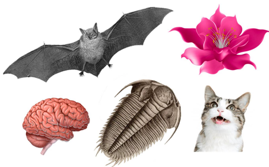
Figure 2. Pictures representing bat echolocation, flowering plants, human intelligence, trilobites, and cat domesticity whose evolutions all defy the neo-Darwinian model.

Examples of evolutionary changes at odds with the conventional neo-Darwinism have been published previously [24,25]. These will now be mentioned, but only cursorily, in further support of the notion that neo-Darwinism cannot be the whole story. (1) Humans are now far more intelligent than required for their hunting-gathering >10,000 years ago (unless living-off-the-land activities of our ancestors are equated with solving differential equations, writing symphonies, designing computers, or even driving an automobile). From where, therefore, did our intelligence derive? (2) Domestication of wildcats into housecats, a process that involved multiple genetic and physical modifications, took place in less than 12,000 years. This is a trivial time period relative to both mutational and evolutionary time-scales. (3) During the so-called Cambrian explosion, about 540 million years ago, a period of incredible diversity of life began. Most currently known body plans first emerged during this time. Yet fossils of ancestors to Cambrian life cannot be found in pre-Cambrian rock, in opposition to what is expected from neo-Darwinism. S. J. Gould once commented that “The Cambrian explosion was the most remarkable and puzzling event in the history of life” [26]. (4) Flowering plants appeared abruptly in the Cretaceous period, with fossil records showing no previous forms related to these angiosperms. Darwin himself called flowering plants an “abominable mystery” (Figure 2) [27,28].