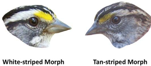
Figure 1. Plumage polymorphism in the white-throated sparrow. In both sexes, the white-striped morph (WS; left) has alternating black and white crown stripes, brighter yellow lores, and a clearer white throat patch. The tan-striped morph (TS; right) has alternating brown and tan crown stripes, duller lores, and dark bars within a duller throat patch. doi:10.1371/journal.pone.0048705.g001