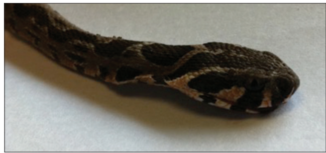
Figure 1: Snake caught by one of the patients ( Daboia palaestinae )

The median time interval from “bite to ED presentation” was 1 h (IQR of 4). The presenting vital signs and ED workup are presented in Table 1. All patients received initial intravenous fluids, antihistamine (diphenhydramine), and steroids (hydrocortisone). Clinical manifestations were classified into local, systemic, hematologic, and neurologic [Table 2]. Local clinical manifestations were seen in the majority of cases (62.5%) and included pain (58.3%), swelling (58.3%) and redness (58.3%), fang marks (37.5%), ecchymosis (25.0%), and numbness (16.7%).