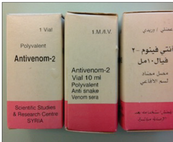
Figure 2: Antivenom in Lebanon (Syria Scientific Studies and Research Center)

WBC: White blood cell, DIC: Disseminated intravascular coagulation, MS: Mental status