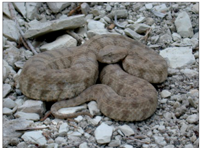
Figure 5: Macrovipera lebetina . Photo courtesy of Professor Riad Sadek (American University of Beirut Medical Center)