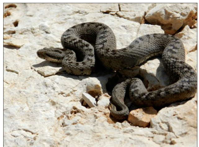
Figure 6: Montivipera bornmuelleri .

Vipera palaestinae venom contains multiple hydrolytic enzymes responsible for cell membrane and endothelial damage and can lead to hematologic abnormalities in bite