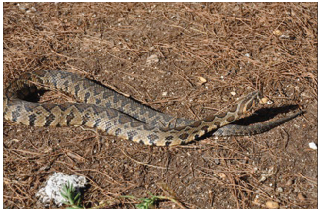
Figure 4: Daboia palaestinae .

M. bornmuelleri was placed on the international union for conservation of nature (IUCN) red list of endangered species in 2006 because of its fragmented geographic distribution. Very few studies regarding the biology of this endemic and rare species exist. M. bornmuelleri venom is a complex mixture of proteins, with dual effect on human blood coagulation having either pro- or anti-coagulant activity at different concentrations. [5,7]